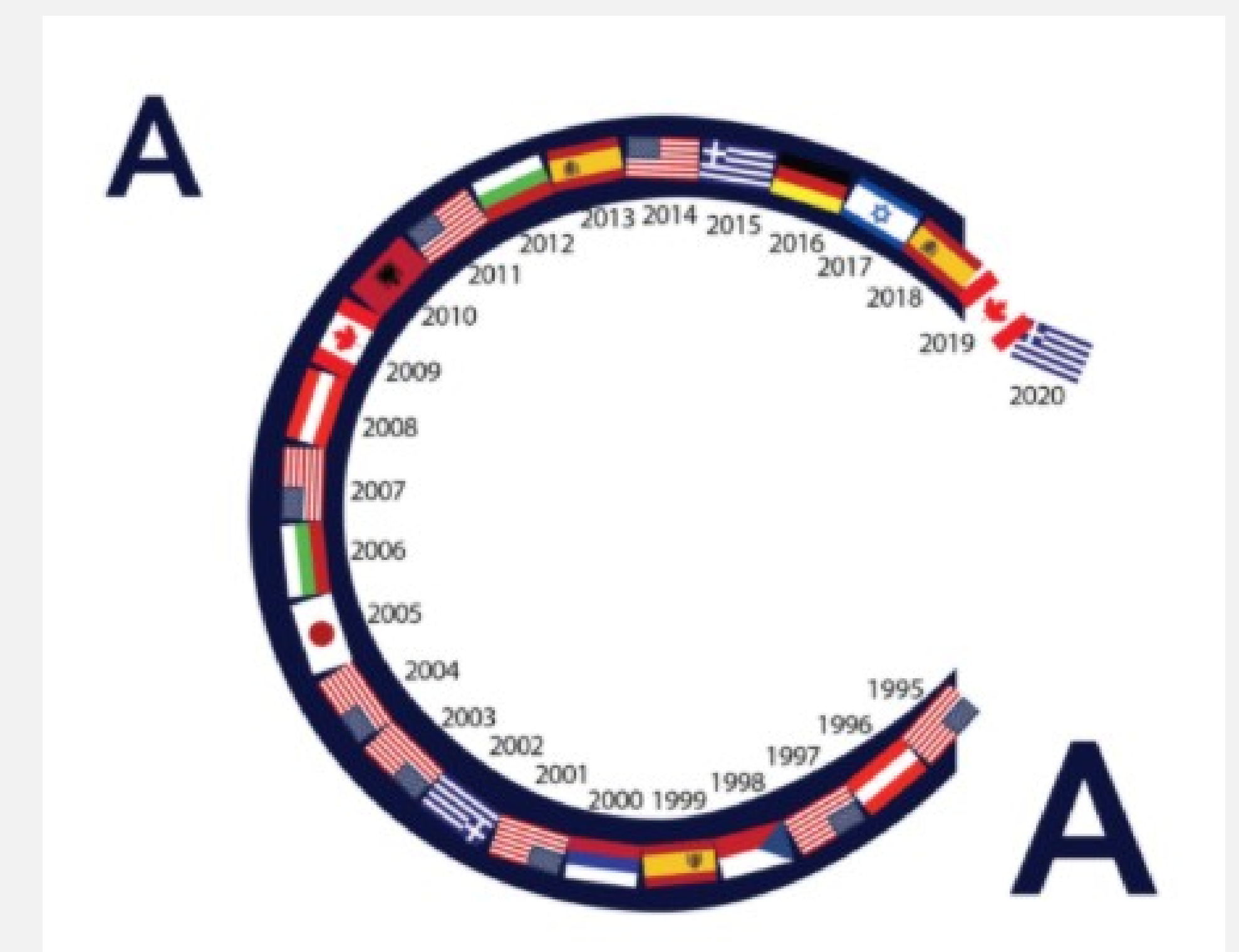
Countries of the first 25 ACA conferences